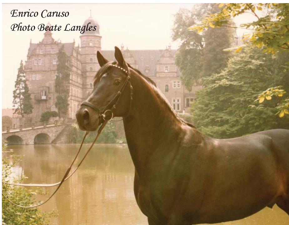
Enrico Caruso