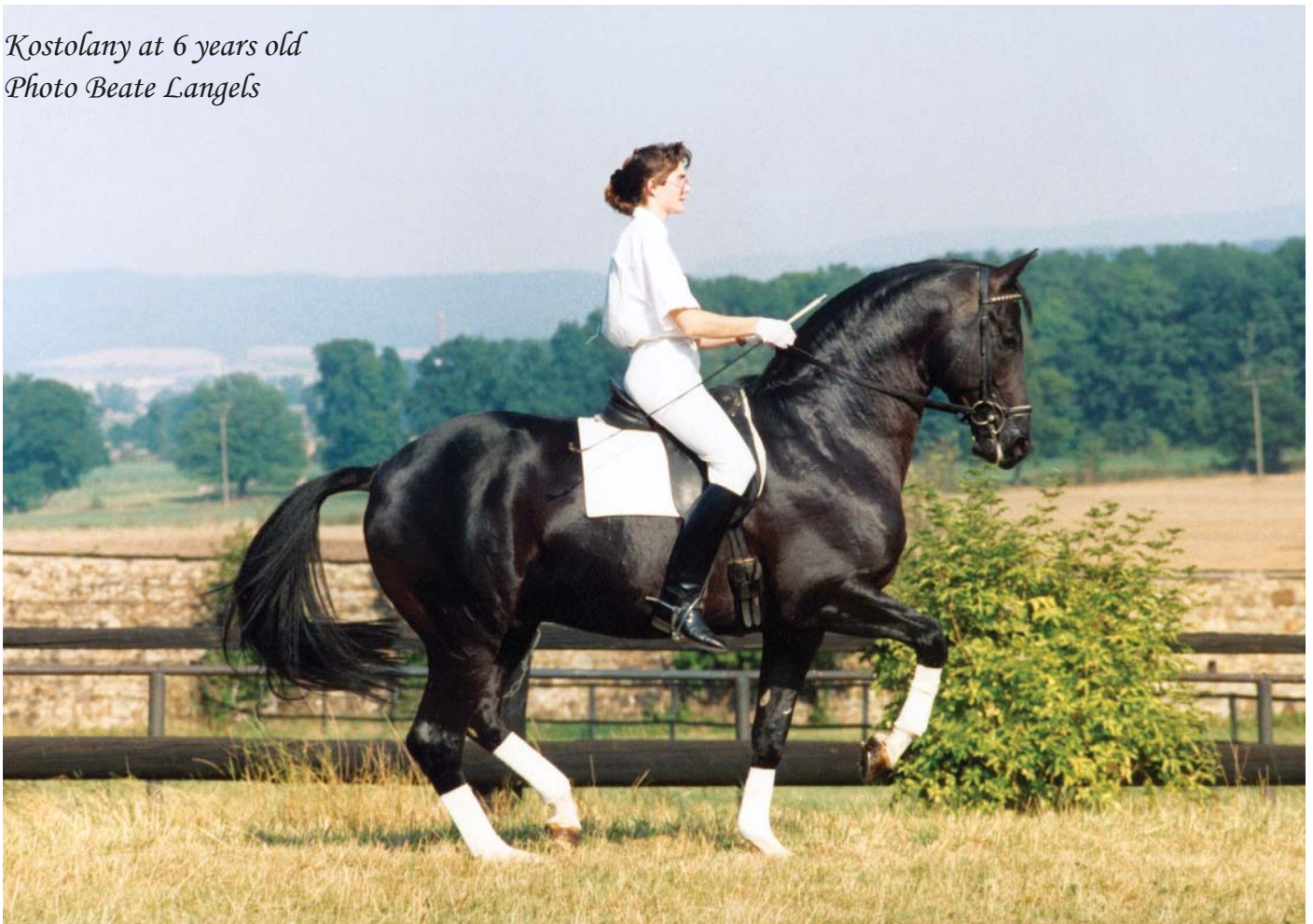
Kostolany at 6 years old