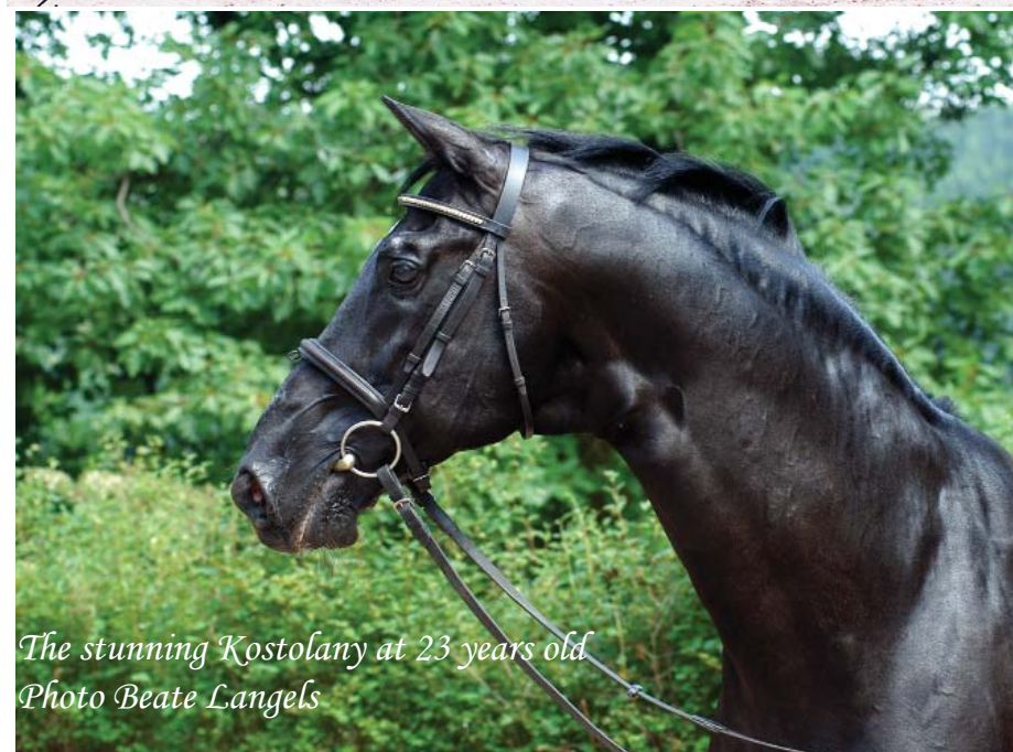
The stunning Kostolany at 23 years old